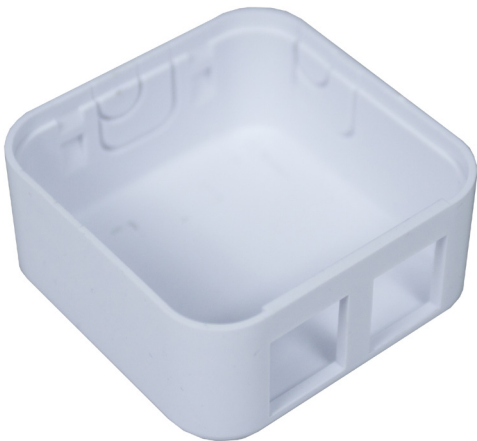
Box cover internal