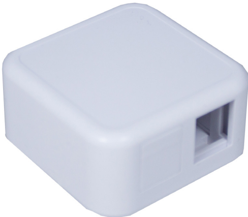
Unloaded box with blank in place